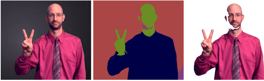
Figure 1: Image Segmentation in a Video Sequence

quality of life not only for disabled but also of their family and relatives. Santos et al. [13] confirmed the positive relationship between quality of life of people and assistive technology (e.g., VISIMP [14]) making it a sought-after invention of our time. These stigmatized and marginalized social groups have now a way to establish their position and promote inclusion within the society.