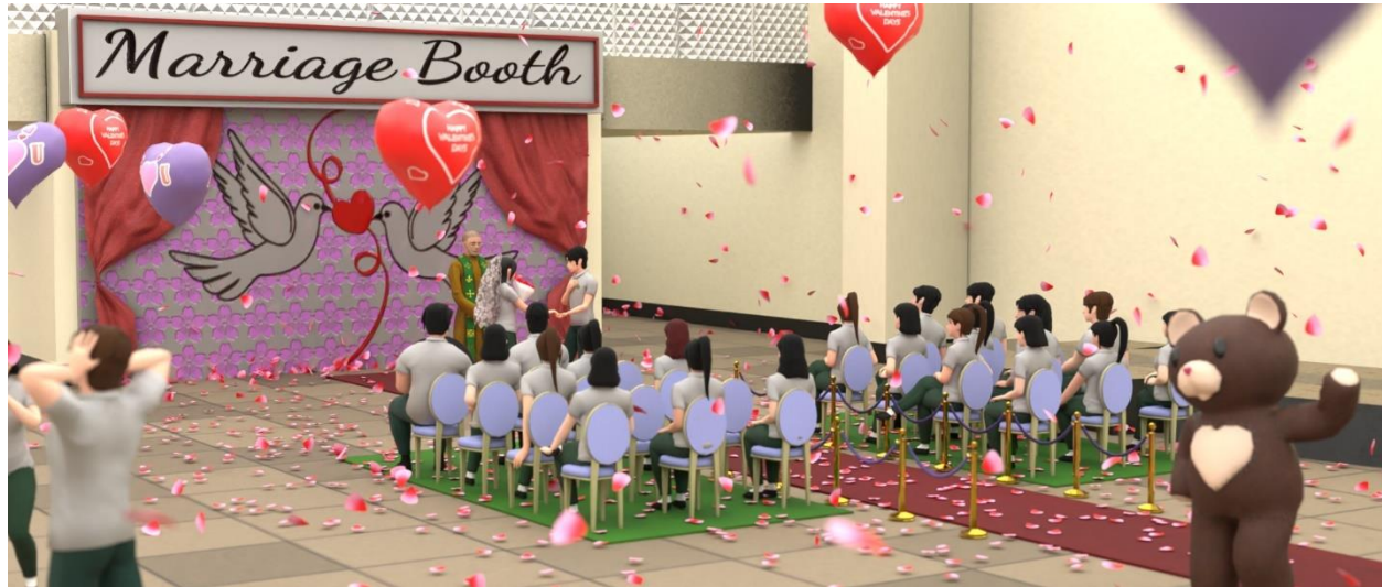
Figure 2. Valentine's Day School Event Hosted in the MILES Virtual World

This progression offers a unique opportunity to study the effects of avatar appearance and behavioral realism within an established educational metaverse environment. The availability of these advancements has made it possible to create four distinct versions of the application, each with different implementations of avatar appearance and behavioral realism.